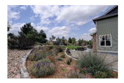
Zone 2 - Extended - Reduce Fuel Zone

Zone 1 is the area within 5-30 feet from buildings or structures or to the property line, whichever is less. This zone is designed reduce the likelihood of a fire burning directly to the structure. Plants should be limited and separated into groups to limit the pathways for fire to burn up to the structure.