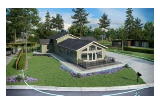
Recommended Non-Combustible Zone

Fuel Modification is the key component of creating a Defensible Space . Proper fuel modification includes spacing to break up the continuous path of fuel that could carry wildfire to your home and increases the chances that structures will survive a wildfire. Proper spacing of plants, shrubs, trees, and other vegetation is necessary and is required by law.