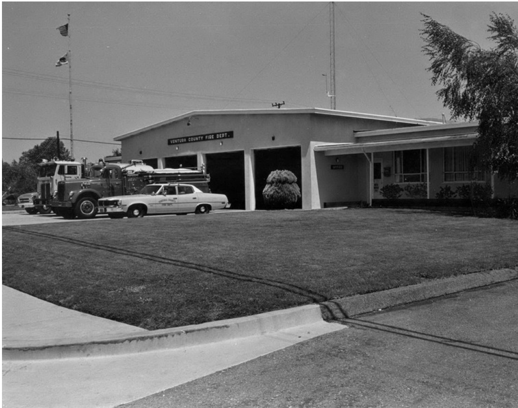
Fire District Headquarters and Station 12 located at 530 W. Main St., Santa Paula, 1956 to 1976.

In 1956, new headquarters were built in Santa Paula at 530 West Main Street. This facility consisted of three major buildings. The first building contained administration offices, Santa Paula Dispatch, a four-stall wide two deep engine-room and crew quarters for Fire Station 12. The second building housed an auto repair shop and the third a warehouse. The district had grown to approximately 75 personnel.