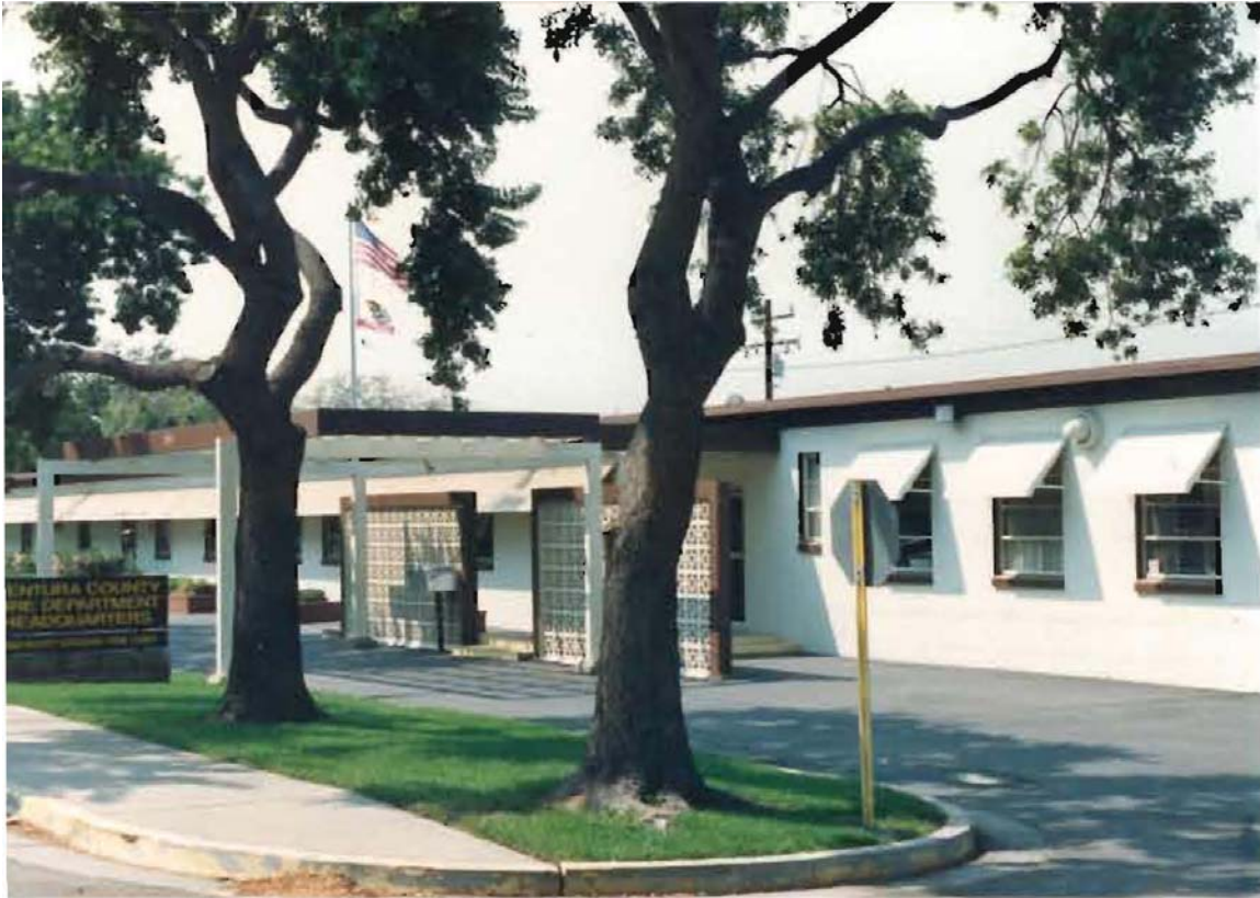
Fire District Headquarters located at 395 Willis Av., Camarillo, 1976 to 1992.

A couple of years later the airport was turned over to Ventura County by the Federal Government. In 1976, Chief Masson made the bold decision to move headquarters from Santa Paula, where it had been located since its beginning, to the Camarillo Airport in the old Air Force hospital building at 395 Willis Avenue.