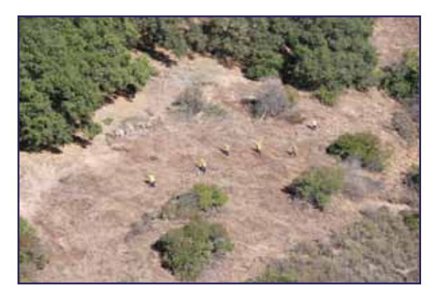
Krotona Hill Project

on top of the hill were protected by the required 100 feet of clearance, but the fuel load was so heavy further down the hill that an advancing fire would certainly overrun the abated area.